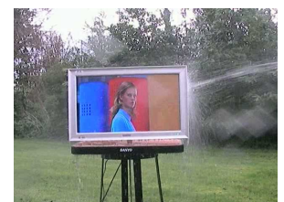
IP56 (Jet Water condition)