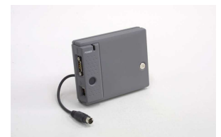
Optional PJ-Net (POA-LN01)